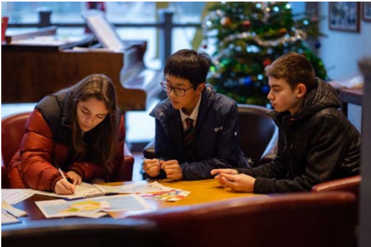
In 2022, The Auckland Project hosted "The Spanish Apprentice", a county-wide competition for students in Key Stage 3, delivered by Durham County Council.

Explore the Spanish Gallery and find out how the Spanish Golden Age shaped the country's art and history as we know them today through a range of themed activities.